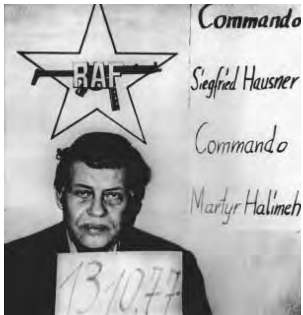
Hanns Martin Schleyer, photographed on October 13, 1977, thirty-eight days after being kidnapped by the RAF. Six days later, following the deaths in Stammheim prison of Andreas Baader, Gudrun Ensslin, and Jean-Karl Raspe, Schleyer was found murdered near the French-German border.