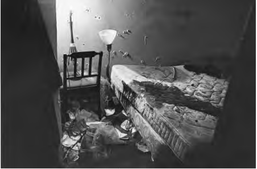
The bed in which Fred Hampton was shot and killed by Chicago police on December 4, 1969. Hampton's assassination prompted the Weathermen to go underground in the weeks following. [Paul Sequiera]