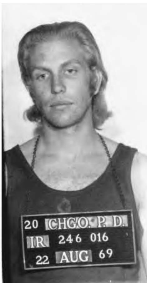
Arrest photos of Bill Ayers, Bernardine Dohrn, and Jeff Jones.