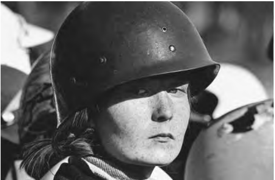
Anonymous Weatherwoman during the Days of Rage. [Paul Sequiera]