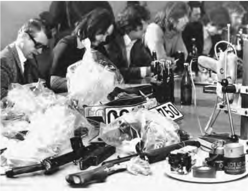
BOTTOM: Weapons seized by West German police in a raid on RAF cells in Frankfurt am Main and Hamburg on February 2, 1974. The cell, known as the "Gruppe vom 4.2" (the date of its capture), was plotting to free RAF prisoners.