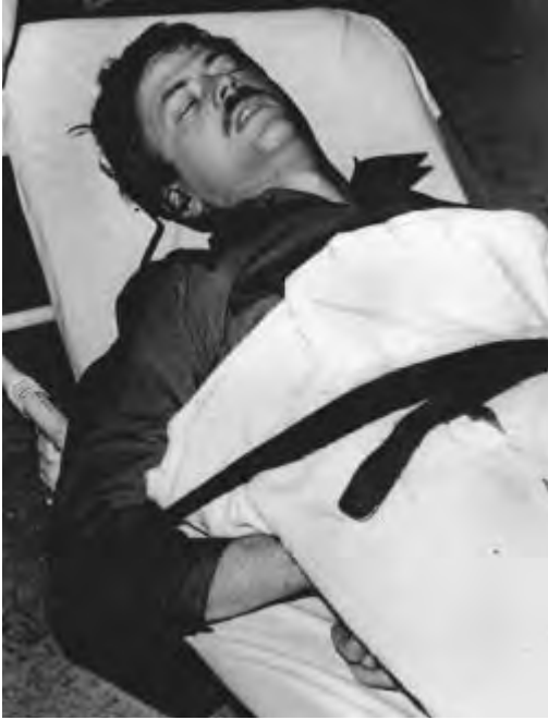
LEFT: Benno Ohnesorg after being shot by police on June 2, 1967, at a demonstration against the visit of the shah of Iran to West Berlin. He soon died from his wounds, and his death instantly radicalized the West German New Left.