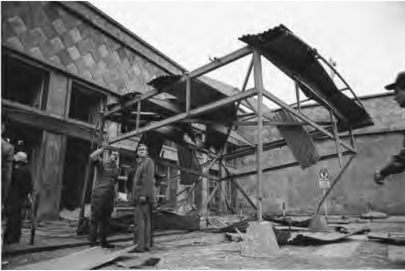
Damage from the RAF's bombing of the headquarters of the U.S. Army Supreme European Command in Heidelberg, on May 24, 1972. Three U.S. military personnel were killed in the attack, the deadliest of the RAF's 1972 "May Offensive."