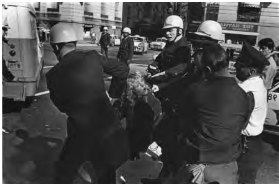
Weatherwoman being arrested during the Days of Rage.