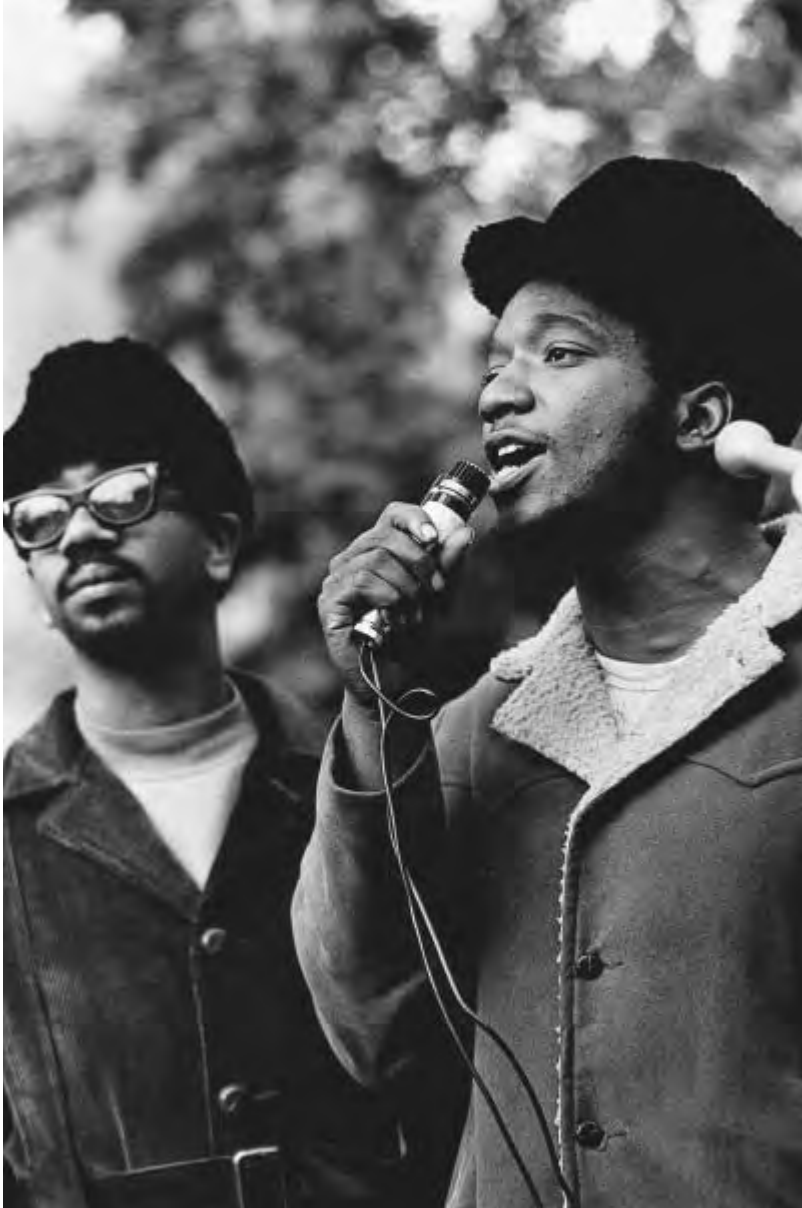
Illinois Black Panther Party Chairman Fred Hampton addresses a Chicago rally in 1969. Bobby Rush, who later became a U.S. congressman, is to his right.