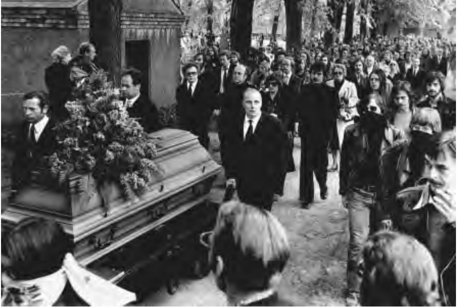
Ulrike Meinhof's funeral on May 15, 1976. Authorities said that Meinhof had hanged herself in her cell in Stammheim prison, but many on the left believed that she had been murdered. Some of the mourners are wearing masks to avoid identification.